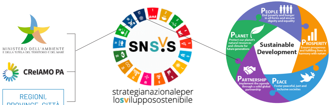
L'azione pilota 2 "Learning MetroCity Out" intercetta tutte le cinque aree Persone, Pianeta, Prosperità, Pace e Partnership della SNSvS - Strategia Nazionale per lo Sviluppo Sostenibile.

Azione pilota 2 LEARNING METROCITY OUT CATEGORIA DI INTERVENTO A - Costruzione della governance delle agende metropolitane per lo sviluppo sostenibile SOTTO-CATEGORIA A2 - Coinvolgimento delle istituzioni locali