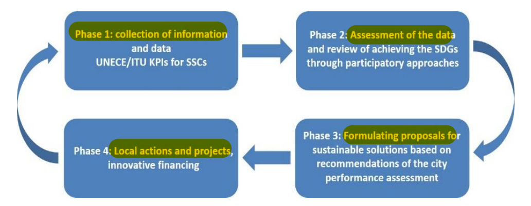
Figure 2 The four phases of VLR development